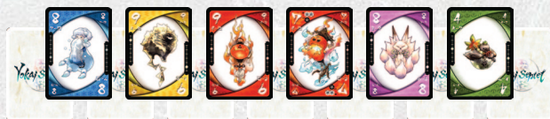
These 13 cards are called your Straw Pile