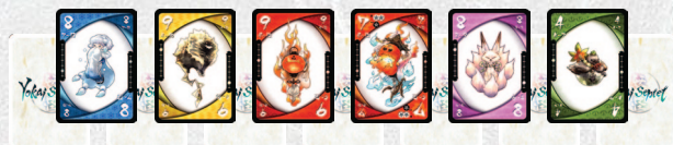
These 13 cards are called your Straw Pile